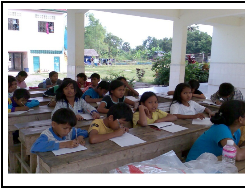
Day Spelling Class with Chomra Translator