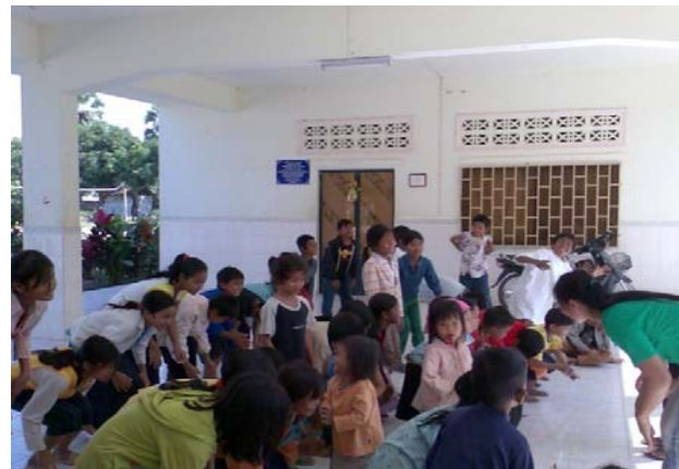
fun time with the children