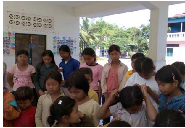
Praise the Lord : 6 neighbour kids accepted the Lord