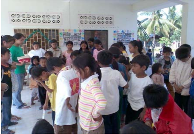
time for sinner's prayer