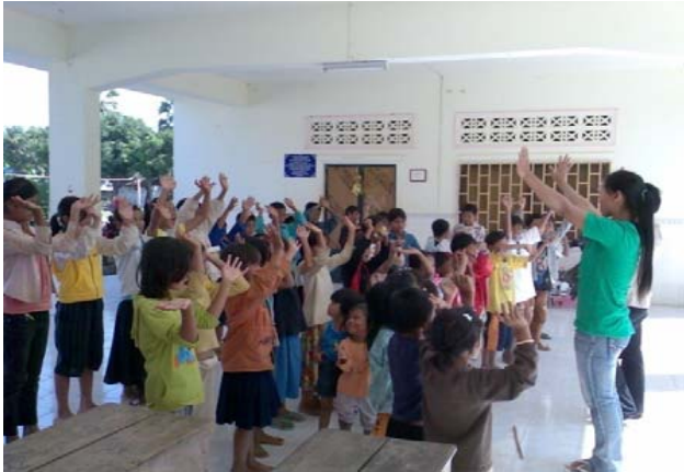
worshipping the Lord

2nd December 2007 - Evangelistic Outreach at Bantey Meanchey Time : At Sunday School with the children and neighbour kids