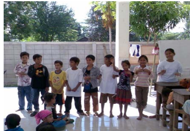
our children singing "How great is our God" to friends