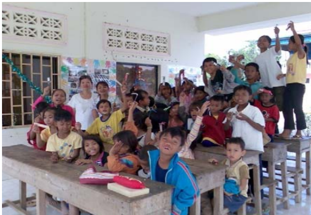
children given "Jesus loves you" bookmark