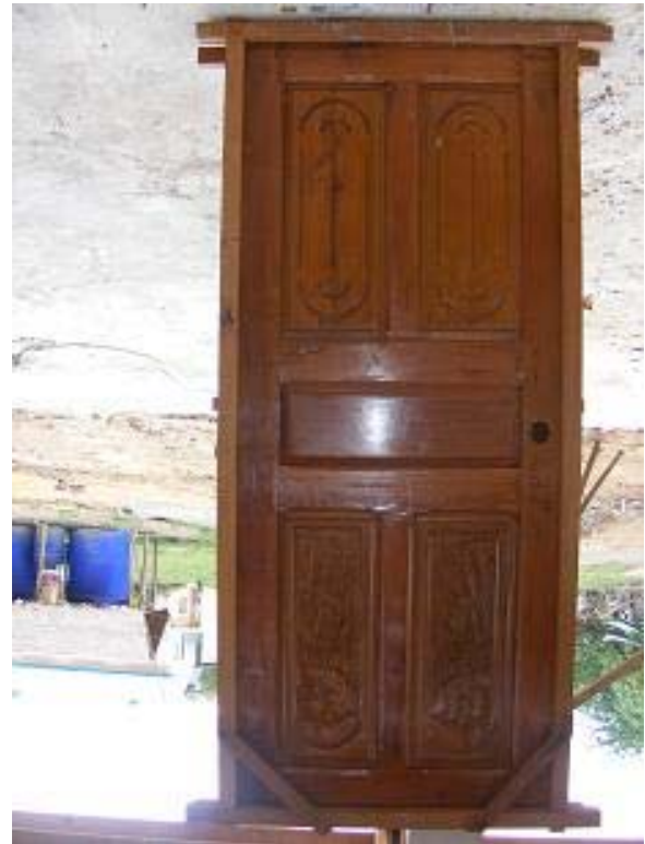
Door of missionary house