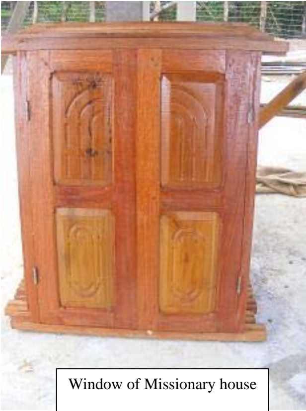
Window of Missionary house