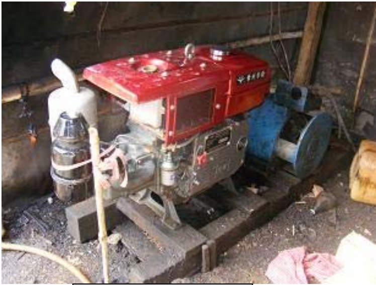
BC New generator