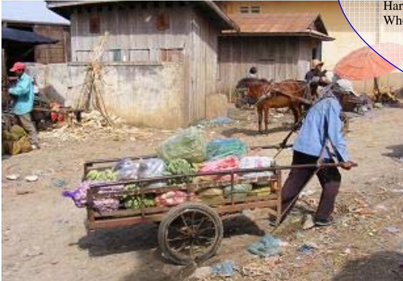
People are working at the train station at the BC town

Look at this older man and Older women is working very Hard daily. Who are they working for .... Thank you for the Father Who are working very hard For the children