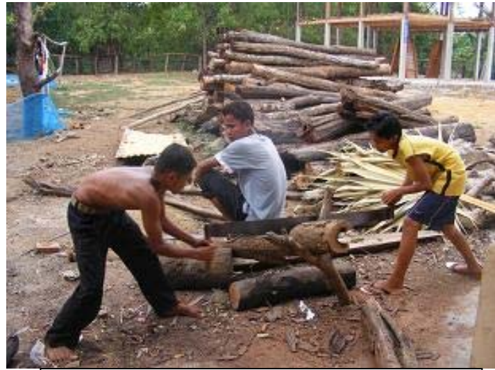
Children are cutting the wood for cook

Look at this older man and Older women is working very Hard daily. Who are they working for .... Thank you for the Father Who are working very hard For the children