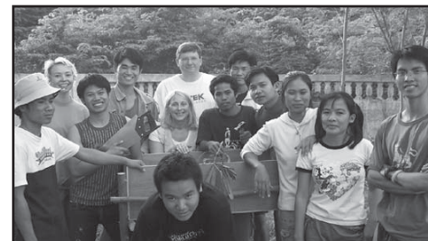
Prop crew for Christmas celebration at Isan Bible Institute