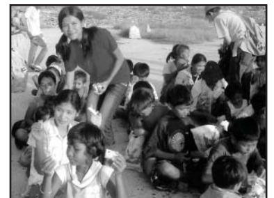
Garbage dump ministry

You can participate through CCSN, sponsoring an orphan, or supporting pastor training/church planting. You are always welcome to join us in reaching out to Cambodia. Just like jello, there's always room for more.