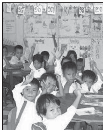
Preschool class at Rongko