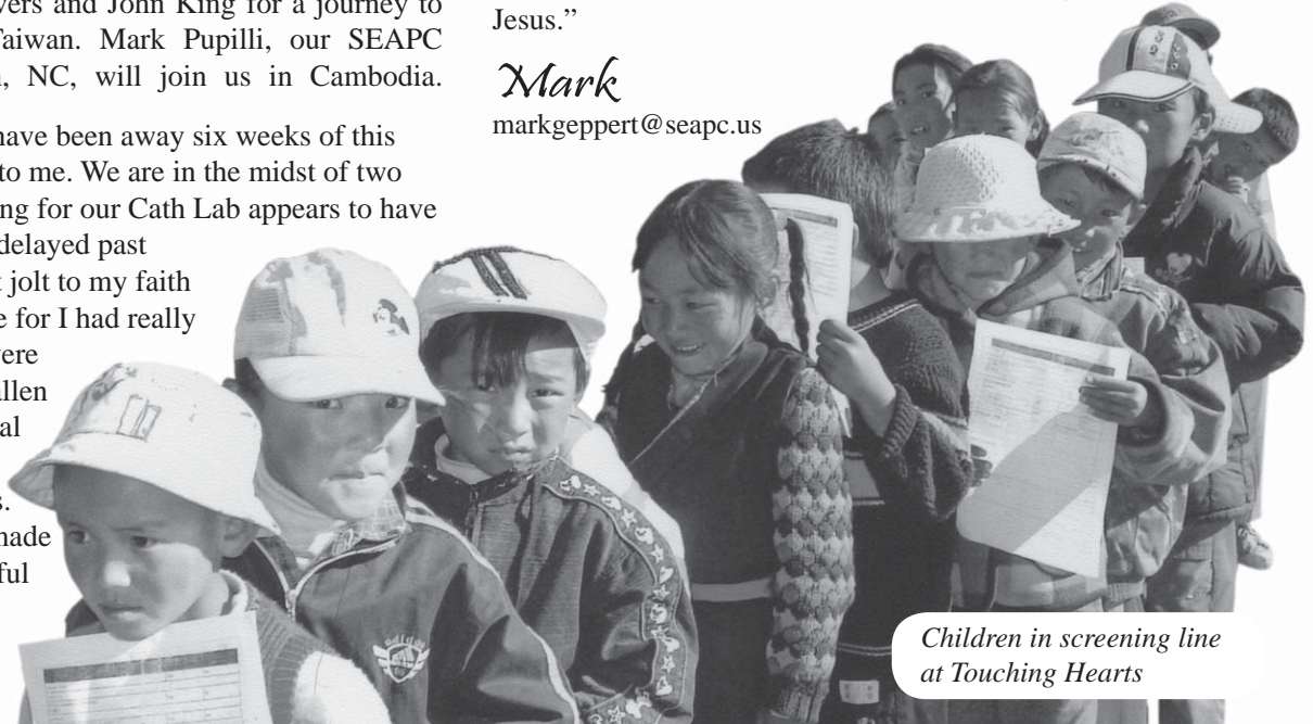
Children in screening line at Touching Hearts