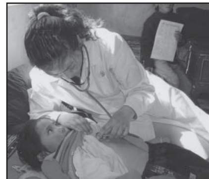
Girl being checked at screening

Your prayers are what make this time feel less pressure packed. Your encouragement and excitement for the project make the financial needs ($5,000 per child) seem more attainable. Please continue to pray for Touching Hearts this month.