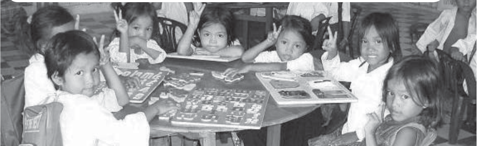
photo: children at Rongko preschool