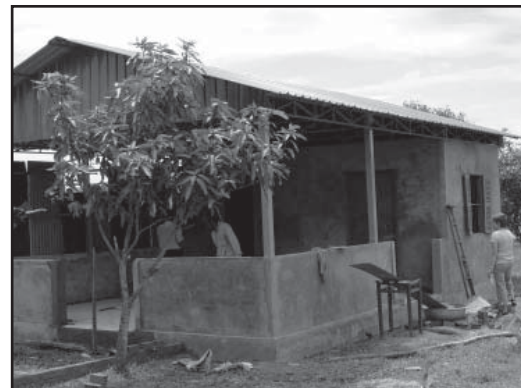
The almost completed kitchen building in Koh Kong