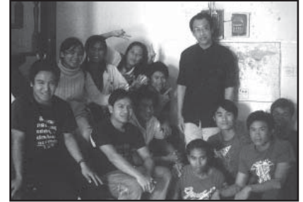
Isan Bible Institute, Thailand

The king is about to meet his appointment. Thailand is on the road to her destiny. The Lord has called SEAPC to be a friend and to disciple the nations. The harvest is plentiful. Now is the time for you and for us to prepare ourselves to be a part of this end-time harvest.