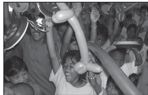
The kids enjoying NHO's 2nd Annual Kids Camp

for future self-sustaining of the school to come and installing a fence around the orchard to protect it from animals. They held a special 3-day training seminar for pastors and leaders. They hosted visiting missions teams. They also held the 2nd Annual Kids Camp for all NHO orphans and staff and even a guest orphanage. This was a 3-day event serving as a spiritual retreat and gathering. Everyone was blessed and had fun. Pictures from camp can be seen on the web site, www.seapc.us .